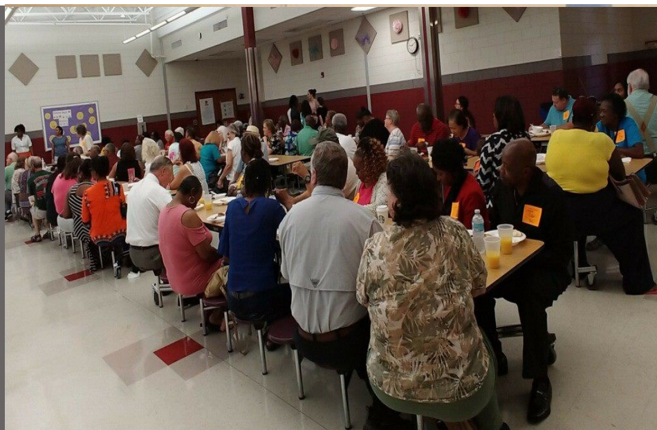
Parents receiving valuable information at a school's parent night

Additionally, the Title I department will provide training to principals so principals will understand parent and family engagement requirements and plan opportunities for family engagement activities and meetings for the remainder of the school year.